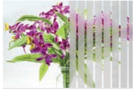
Medium Etched Stripes