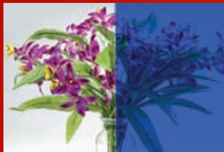
Blue (BLUE SR HPR)