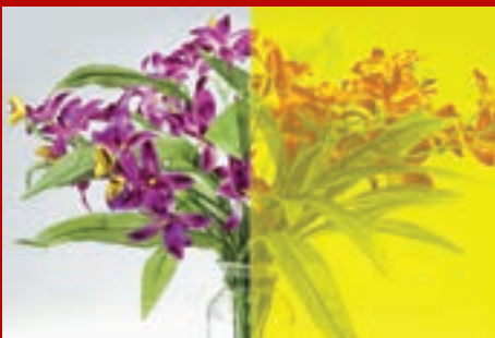
Yellow (YELLOW SR HPR)