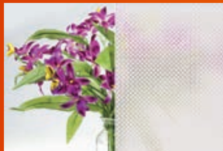
Matte Small Dots (NRM MFSD SR HPR)