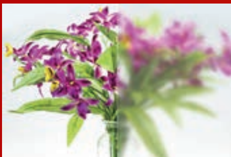
Satin Crystal Clear