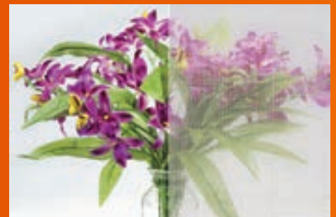
Mini Dots (NRM FMD SR HPR)