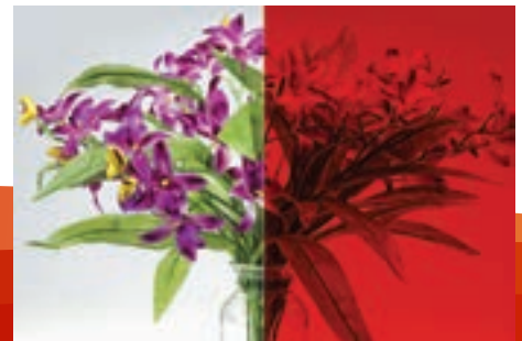
Red (RED SR HPR)