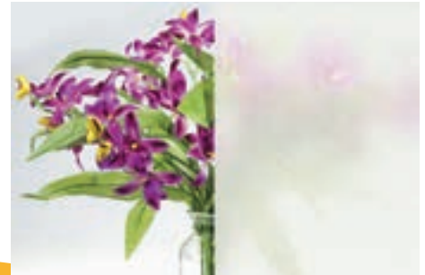
Glacier (NRM55 PS4)