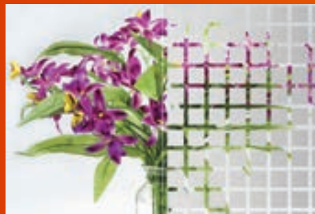
Squares (NRM FSQ SR HPR)