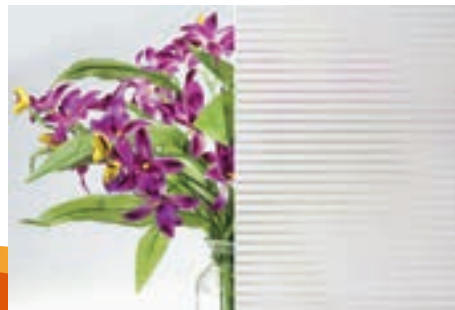
Matte Stripes (NRM MFS SR HPR)