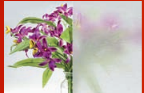
Brushed Crystal (NRMV BC HPR)