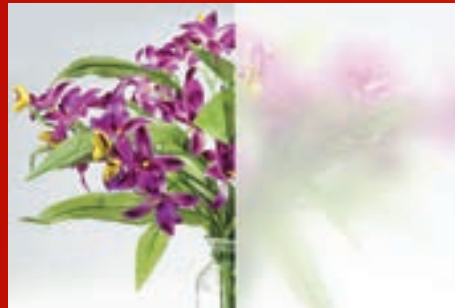
Satin Crystal (NRMV SC HPR)