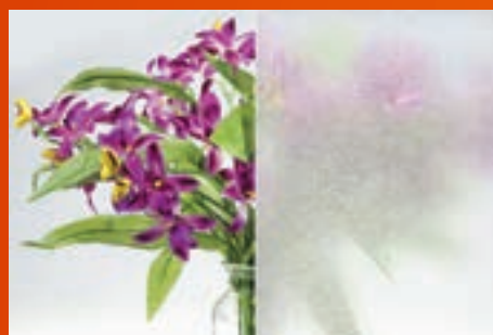
Rice Paper (NRM FRP SR HPR)