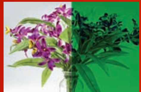
Green (GREEN SR HPR)